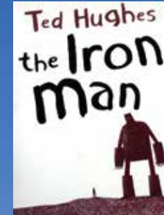
Book: The Iron Man Author: Ted Hughes Genre: Science Fiction