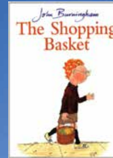
Book: The Shopping Basket Author: John Burningham Genre: Fiction